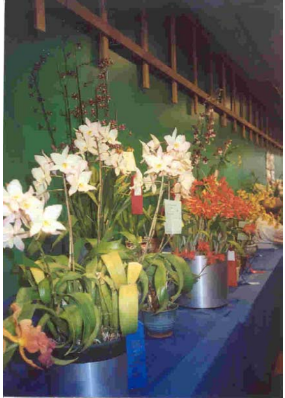
More SCVOS Show Plants