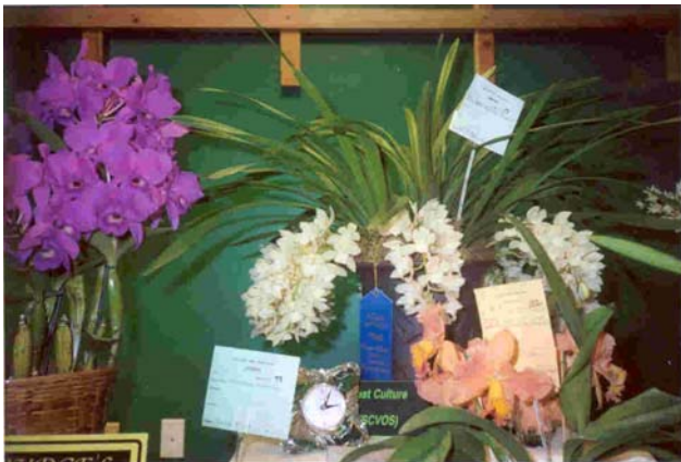
SCVOS Show Plants

Walter Shinn (650) 591-4904 Walter.shinn@sri.com