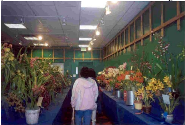
Scene from SCVOS Show, April, 2005